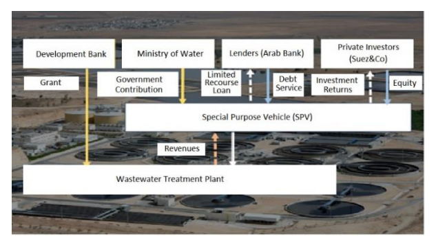
Figure 1: Investment contract model

The SPV financed the remaining $110 millions, including 102 million in commercial debt from a syndicate of Jordanian local banks and other institutions arranged by the Arab Bank. The remaining 8 million was financed by the consortium in the form of equity.