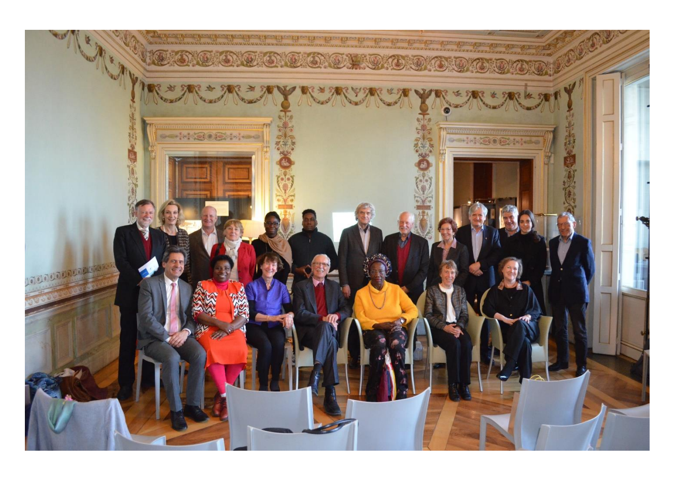
Panel and guests March 20, 2018