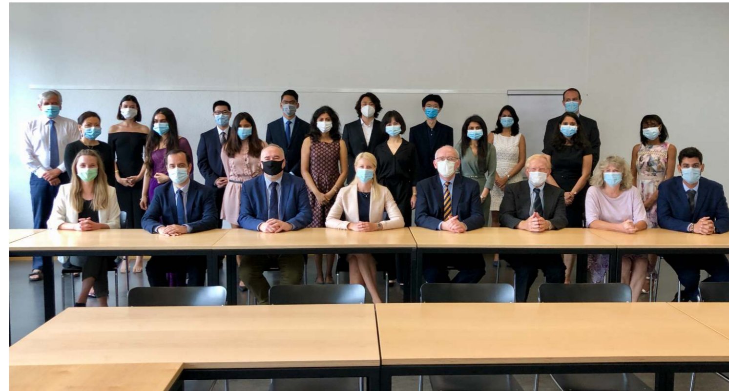
Class picture in the time of a global pandemic: The class of 2020-21 with WTI Staff members.