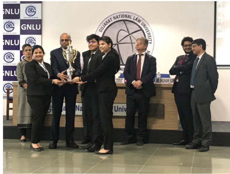
The winners of the 2020 edition of the Gujarat Moot Court.

For more information, please visit the Outreach section of our website: www.wti.org/outreach/outreach-activities and www.wti.org/outreach/outreach-activities/advisory-services